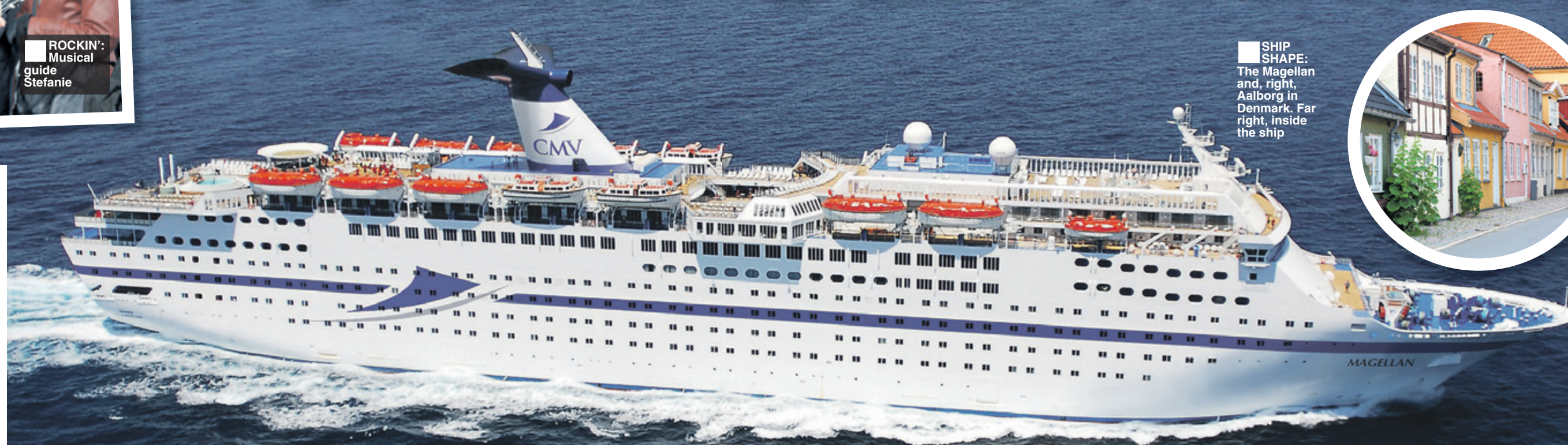
SHIP SHAPE: The Magellan and, right, Aalborg in Denmark. Far right, inside the ship